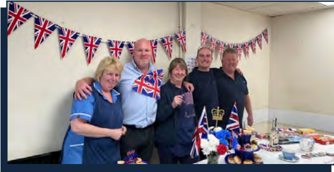
Some of the team at our afternoon tea

To celebrate the coronation of King Charles III we held an afternoon tea for our hard working and dedicated team in early May.